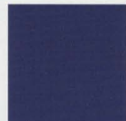
601 – Sapphire

Custom colors are available – call for details 330.668.1515 Fax: 330.668.1513